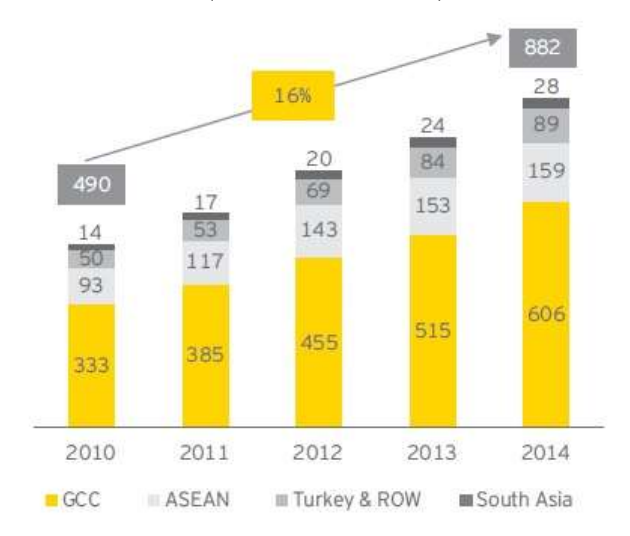
Figure 1. Total of Global Islamic Banks' Assets (In billions of USD)